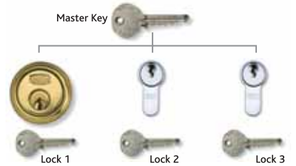
UNION Master Key Diagram