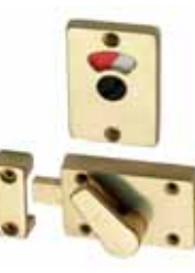
UNION CZ80941 10.6