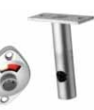
UNION AL5063-06AS 3.29