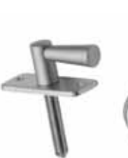
UNION AL8294AS 10.6