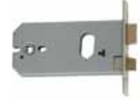
UNION L-2041-152 4.11 Horizontal Lock Case