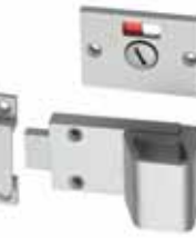
UNION AL8098 10.6