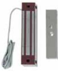
UNION 12V-300-U Electro Magnetic Lock