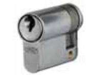
UNION 2 X 20 4.6