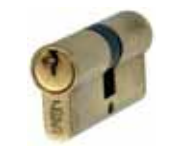
UNION 2 X 18 4.5