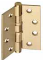
UNION 8352-100 10.8