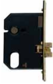
UNION L-2441-78 4.43 Sliding Door Lock Case