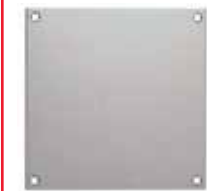
UNION 5066-06 3.30