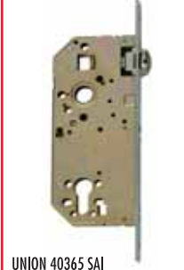
UNION 40365 SAI 4.69 Roller Latch & Dead Bolt Lock Case