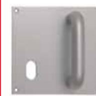
UNION SS5D67-13 3.6