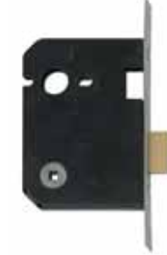
UNION 21314-76 4.17 Bathroom WC Deadlock