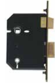
UNION 2226-78 4.29 Bathroom WC Lock