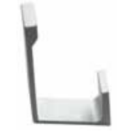
UNION AL8723 10.9