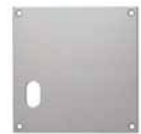
UNION 5066-13 3.30