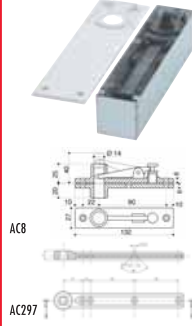
UNION 761 8.17