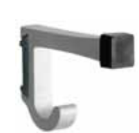
UNION AL8253AS 10.9