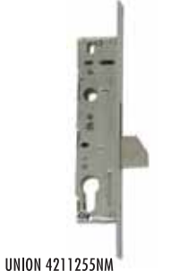
UNION 4211255NM 4.60 Narrow Stile Swing Bolt Lock Case