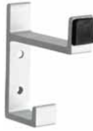
UNION AL8722 10.9