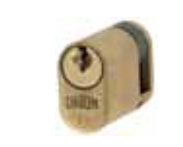
UNION 2 X 8 4.10