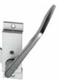
UNION 99004SS 10.3