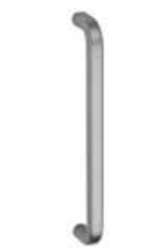
UNION AL587-300BB - Pair 3.3