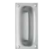
UNION SS5D63-06 3.6