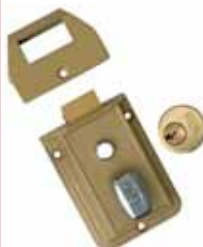
UNION 1022 Night Latch