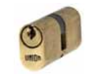
UNION 2 X 6 4.9