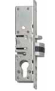
UNION L-JH2E-41 7.27 Narrow Stile Night Latch Case