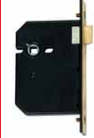
UNION 2657-78 4.45 Latch