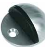
UNION 87001SS 10.2