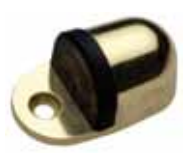
UNION CZ8731 10.1