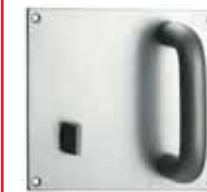
UNION SS5D67-73 - Pair 3.6 INSIDE VIEW