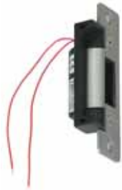
UNION Trimec TS101A