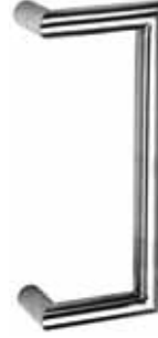
UNION 5210BBSS - Pair