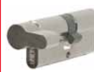
UNION 2 X 815/T 4.8