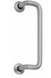
UNION AL5512-300BB 3.8 -Pair Back to Back UNION AL5512-300BT-Single UNION AL5512-300FL-Single