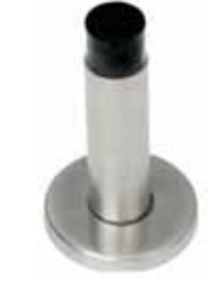
UNION 99022 10.2 Wall Mounted Door Stop